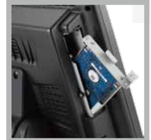
Easy HDD removal