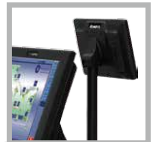
10.1" 2nd display