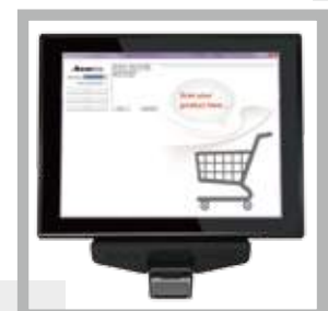
Wall-mount price checker application