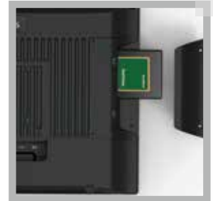
Easy HDD removal