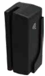
MSR+RFID / RFID