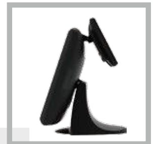
Stylish and curved