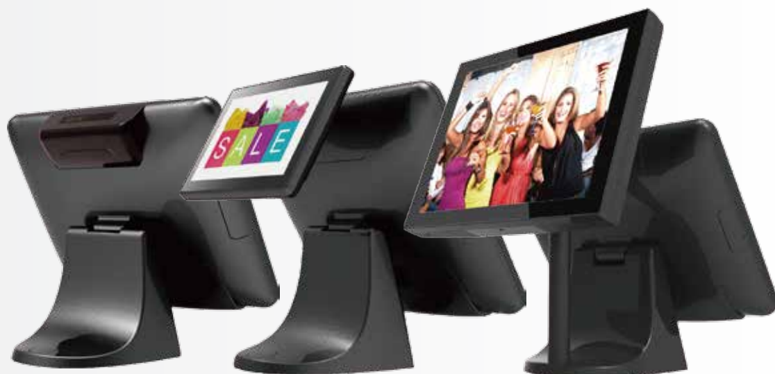
Various 2 nd display options (VFD / 10.1" / 15")