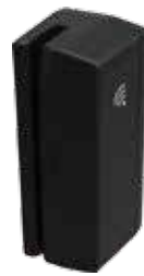
MSR+WiFi / WiFi