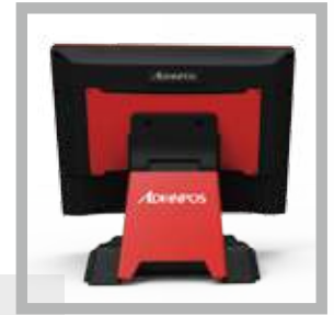
Die-casting back for better heat dissipation