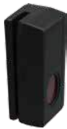
MSR+Fingerprint / Fingerprint