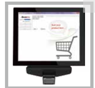
Wall-mount price checker application