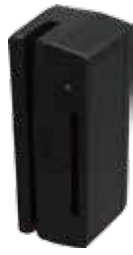
MSR+IC card reader / IC card reader