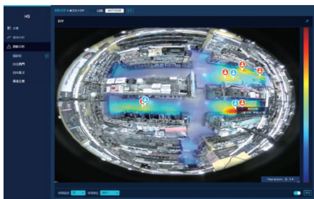
▲ Heatmap Analysis